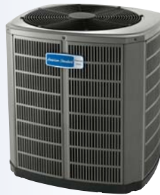
AccuComfort™ Platinum 18