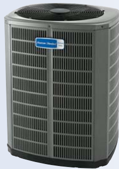
AccuComfort™ Platinum 20

American Standard Platinum air conditioners offer our highest combination of performance, efficiency, and temperature control. Built with American Standard's commitment to quality throughout, the Platinum line offers advanced energy-saving features like Duration™ variable speed compressors and Spine Fin™ coils.